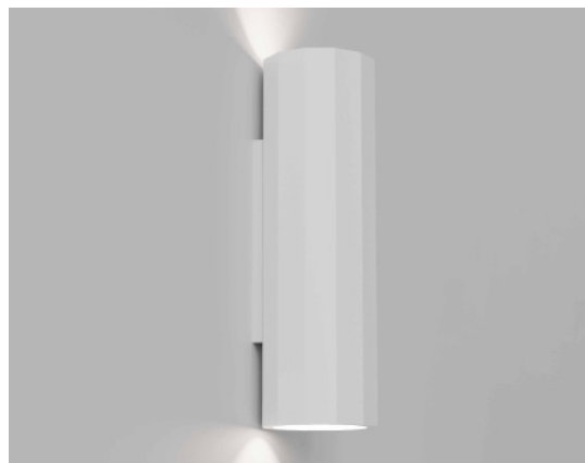
CODE: 1414002 FINISH: PLASTER

TO MAINTAIN THIS PRODUCT TO ITS BEST CONDITION, PLEASE VIEW OUR CARE AND CLEANING GUIDE ON THE SUPPORT SECTION OF THE ASTRO WEBSITE.