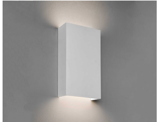
CODE: 1325002 FINISH: PLASTER

TO MAINTAIN THIS PRODUCT TO ITS BEST CONDITION, PLEASE VIEW OUR CARE AND CLEANING GUIDE ON THE SUPPORT SECTION OF THE ASTRO WEBSITE.