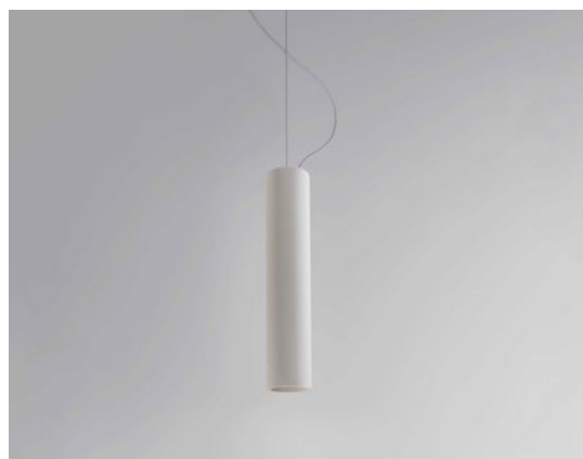
CODE: 1252014 FINISH: PLASTER

TO MAINTAIN THIS PRODUCT TO ITS BEST CONDITION, PLEASE VIEW OUR CARE AND CLEANING GUIDE ON THE SUPPORT SECTION OF THE ASTRO WEBSITE.