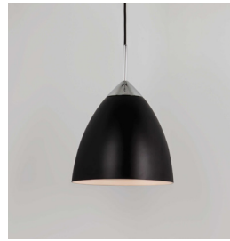
CODE: 1223023 FINISH: MATT BLACK