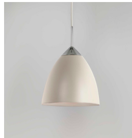
CODE: 1223025 FINISH: CREAM

TO MAINTAIN THIS PRODUCT TO ITS BEST CONDITION, PLEASE VIEW OUR CARE AND CLEANING GUIDE ON THE SUPPORT SECTION OF THE ASTRO WEBSITE.