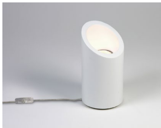
CODE: 1218001 FINISH: PLASTER

TO MAINTAIN THIS PRODUCT TO ITS BEST CONDITION, PLEASE VIEW OUR CARE AND CLEANING GUIDE ON THE SUPPORT SECTION OF THE ASTRO WEBSITE.