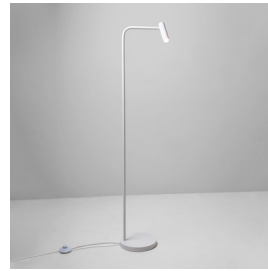
CODE: 1058002 FINISH: MATT WHITE