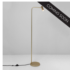
CODE: 1058107 FINISH: MATT GOLD

TO MAINTAIN THIS PRODUCT TO ITS BEST CONDITION, PLEASE VIEW OUR CARE AND CLEANING GUIDE ON THE SUPPORT SECTION OF THE ASTRO WEBSITE.