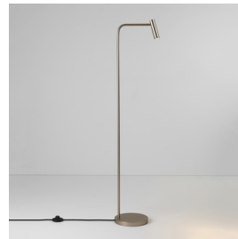
CODE: 1058058 FINISH: MATT NICKEL