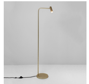
CODE: 1058104 FINISH: MATT GOLD