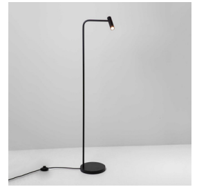
CODE: 1058003 FINISH: MATT BLACK